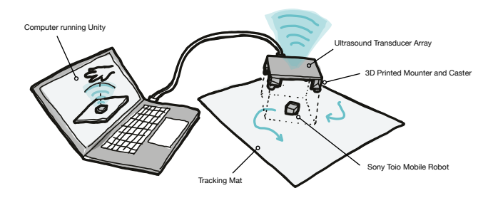
Figure 2: System Design to enable 2D translations of ultrasound transducers using Sony Toio tabletop robots

We'll use Sony Toio [7] robots for mobile robotic-based 2D translations. Toio robots have two wheels and can move within a 55cm x 55cm area. As shown in Figure 3, we aim to mount ultrasound transducer arrays on top of the Sony Toio robots with 3D printed castors. Sony Toios use built-in cameras to track their position on a